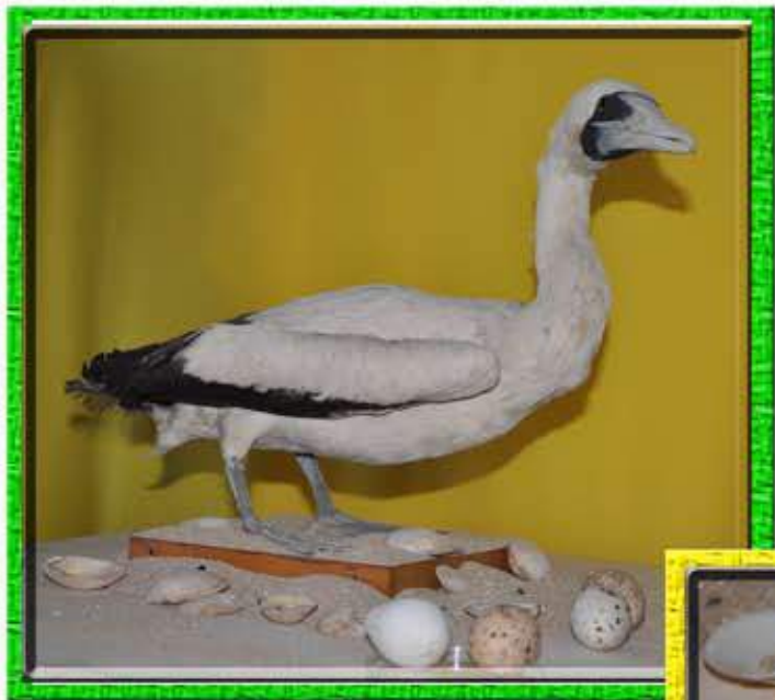
A Photo of a preserved Masked Booby Bird (Sula dactylatra) and its eggs (right) from the Natural History Museum of Jamaica