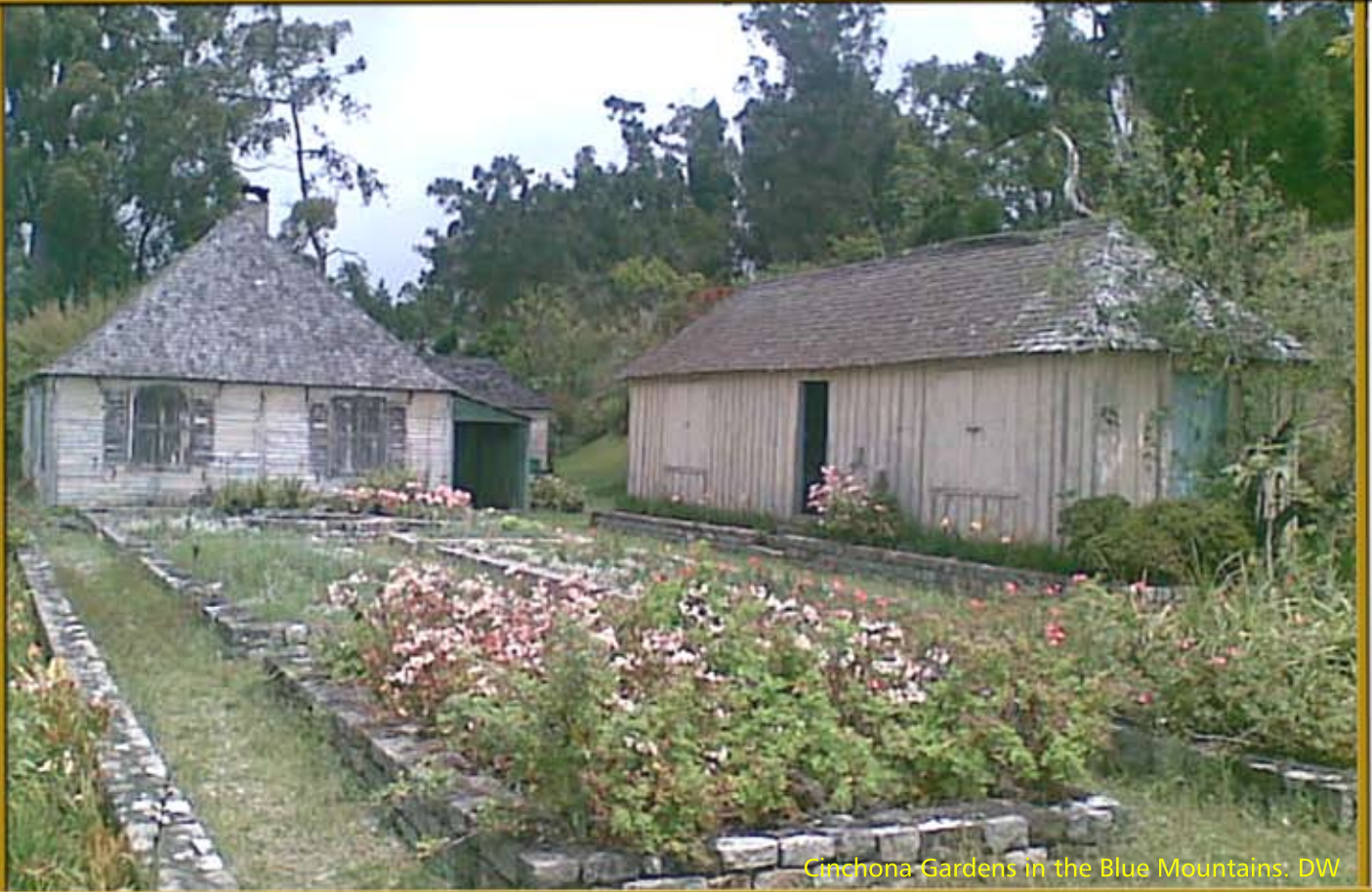
Cinchona Gardens in the Blue Mountains: DW

The Junction Road - accompanied by the Wag Water River - curves down through the valleys of the foothills of the world famous Blue Mountains. High up in these majestic mountains is the gardens with the highest altitude, not just in Jamaica but in the Caribbean. Cinchona Gardens, proudly standing at a height of about 5000ft is sister to Castleton Gardens located in 'the Junction'.