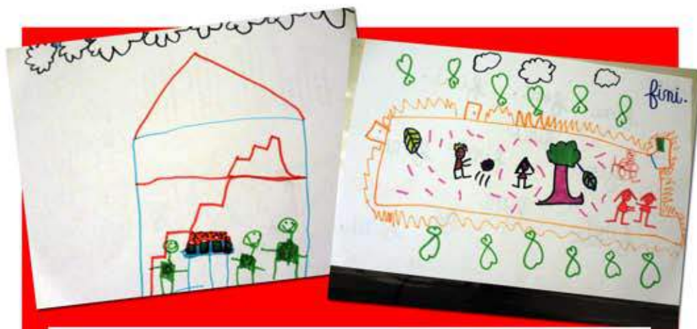
Drawings submitted by Kindergarten students of the Ecole d'Hargnies, North of France near the Belgium border.